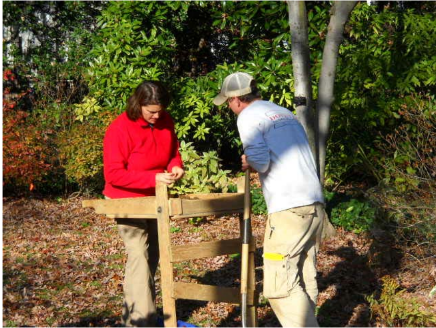
Dovetail Cultural Resources conducted the archaeological survey, which will inform future scholarship and interpretation.

reference in future improvements) areas without significant subsurface cultural significance; and providing archaeological context for past and future excavations. It consisted of a pedestrian survey, close-interval subsurface "shovel tests" to recover artifacts, and mapping of all points of interest using GPS.